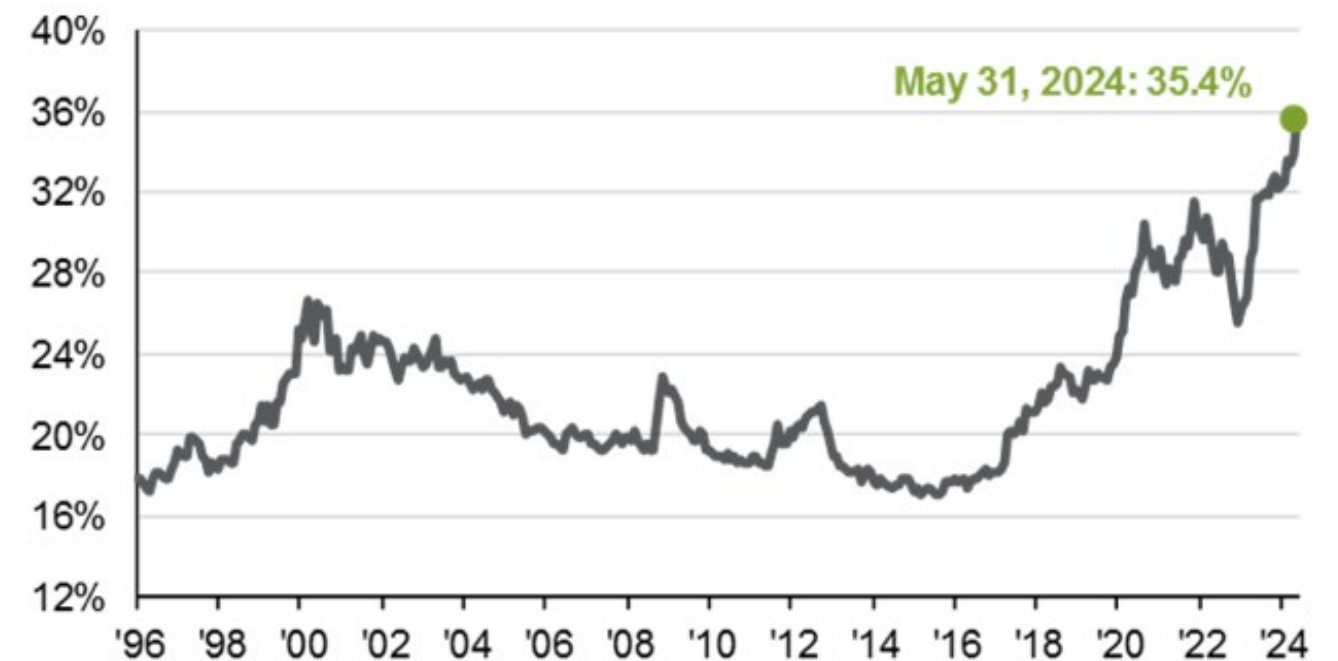
Weight of the top 10 stocks in the S&P 500 % of market capitalisation of the S&P 500